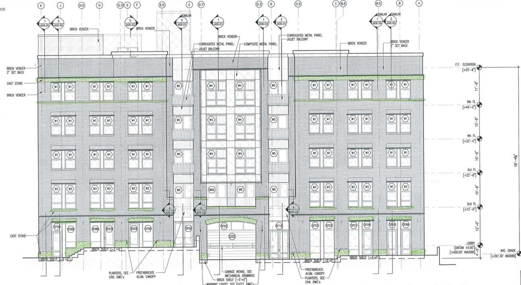
1 BUILDING ELEVATION - WEST FACADE SCALE: 1/8" = 1'-0"

- - - - - LINTELS & RELIEVING ANGLED - - - - - SEISMIC ANGLE TO LATERALLY SUPPORT CMU WALL IN SIDE - - - - - OPTIONAL RELIEVING ANGLE