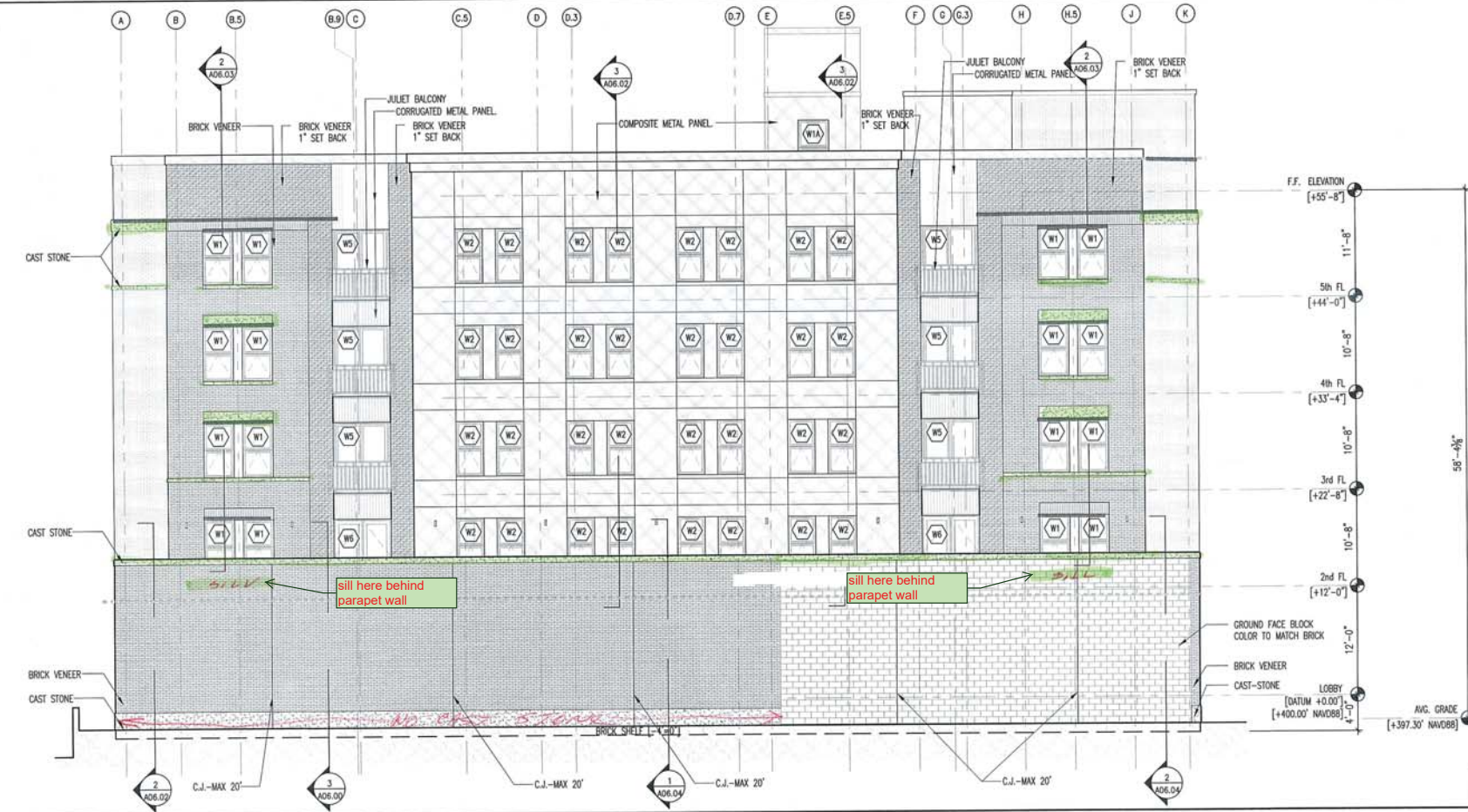
2 BUILDING ELEVATION - EAST FACADE SCALE: 1/8" = 1'-0"

REFER TO SHEET A03.02 FOR MATERIAL PALETTE FINISH DIAGRAM